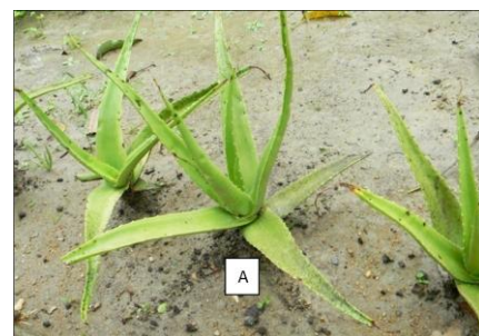
Fig A: Aloe vera plant