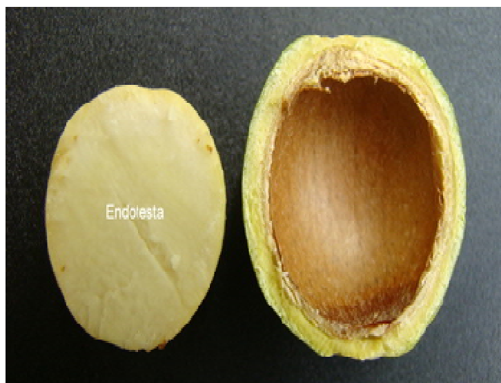
Fig 2: Endotesta separated from ovule