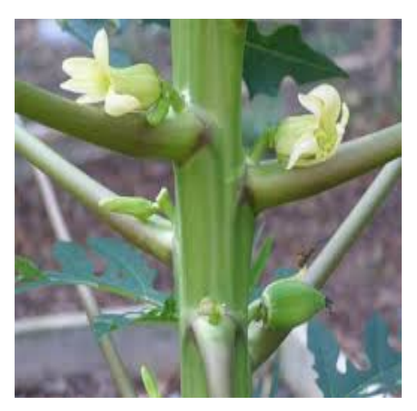
Fig 3: Carica papaya flowers

Papaya plants are dioecious or hermaphroditic, producing only male, female or bisexual (hermaphroditic) flowers. Papay as are sometimes said to be "trioecious" meaning that separate plants bear either male, female, or bisexual flowers (Fig. 3). Female and bisexual flowers are waxy, ivory white, and borne on short penducles in leaf axils, along the main stem. Flowers are solitary or small cymes of 3 individuals. Ovary position is superior. Prior to opening, bisexual flowers are tubular, while female flowers are pear shaped. Since, bisexual plants produce the most desirable fruit and are self–pollinating, they are preferred over female or male plants. A male papaya is distinguished by the smaller flowers borne on long stalks. Female flowers of papaya was pear shaped, when unopened whereas, bisexual flowers are cylindrical [4].