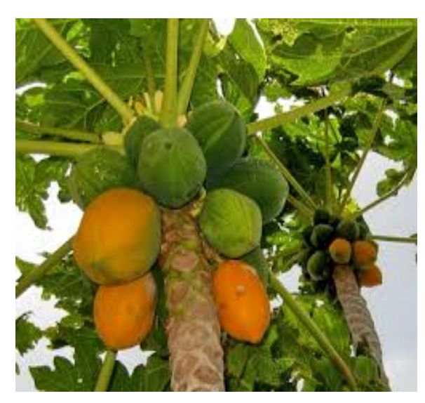
Fig 1: Carica papayaplant

Papaya plant is a large, single–stemmed herbaceous perennial tree having 20–30 feet height (Fig. 1). The leaves are very large (upto 2^{\frac{1}{2}} feet wide), palmately lobed or deeply incised with entire margins and petioles of 1-3 feet in length. Stems are hollow, light green to tan brown in color with diameter of 8 inches and bear prominent of scars [4].