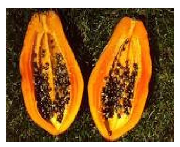
Fig 2: Carica papaya fruit

The fruits are big oval in shape and sometimes called pepolike berries, since they resemble melon by having a central seed cavity (Fig. 2). Fruits are borne axillary on the main stem, usually singly but sometimes in small clusters. Fruits weigh from 0.5 up to 20 lbs, and are green unlike ripe, turning yellow or red orange. Flesh is yellow-orange to salmon (pinkishorange) at maturity. The edible portion surrounds the large central seed cavity. Individual fruits mature in 5-9 months, depending on cultivator and temperature. Plants begin bearing fruits in 6-12 months [4].