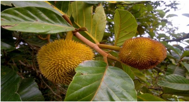
Fig 1: Plant of Artocarpus hirsutus

GC-MS is the best technique to identify the bioactive constituents of long chain hydrocarbons, alcohols, acids, esters, alkaloids, steroids, amino and nitro compounds etc. [11]. A wide range of medicinal plant parts is used for extract as raw drugs and they possess varied medicinal properties [12]. Traditionally used medicinal plants have recently attracted the attention of the biological scientific communities. This has involved the isolation and identification of secondary metabolites produced by plants and their use as active principles in medicinal preparations [13].