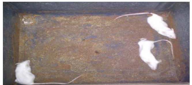
Fig 1: Acetic acid-induced writhing in animals showing the abdominal constriction

The results of the present investigation shows that the ethanolic extract of Holarrhena antidysenterica exhibits maximum analgesic activity at 20 min at the given dose 250 mg/kg (i.p.), ( p < 0.01 ) and it was significant when compared with control and standard group. The chloroform extract showed a considerable activity whereas the pet ether extract activity was seen to be insignificant as compared to the standard (Fig 2). The photograph in Fig 1 depicts the abdominal constriction (writhing) method of analgesic activity. The results are tabulated in the table 1.